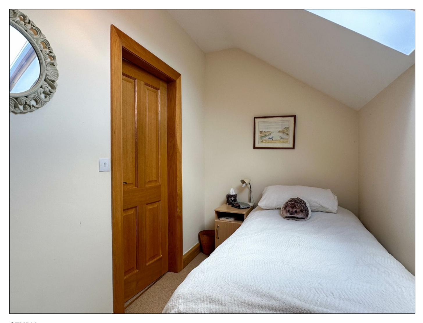
STUDY : 11' 0" x 5' 9" (3.36m x 1.76m) With Keylite roof window, access to eaves storage.

15' 4" x 6' 9" (4.68m x 2.07m) (MAX) With built-in double wardrobe, wash hand basin set in vanity unit, access to eaves storage.